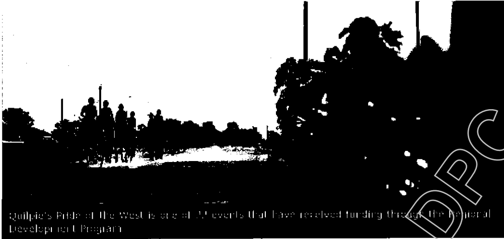
Quilpie's Pride of the West is one of 17 events that have received funding through the Regional Development Program